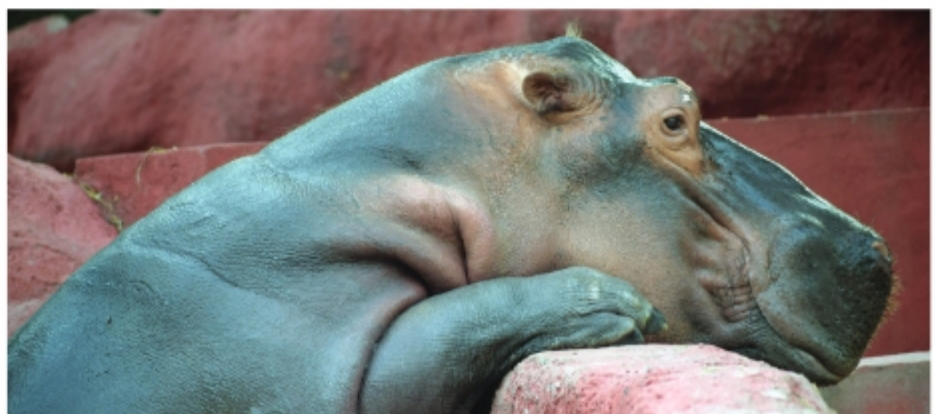
N Pravalika – ASR, HYD