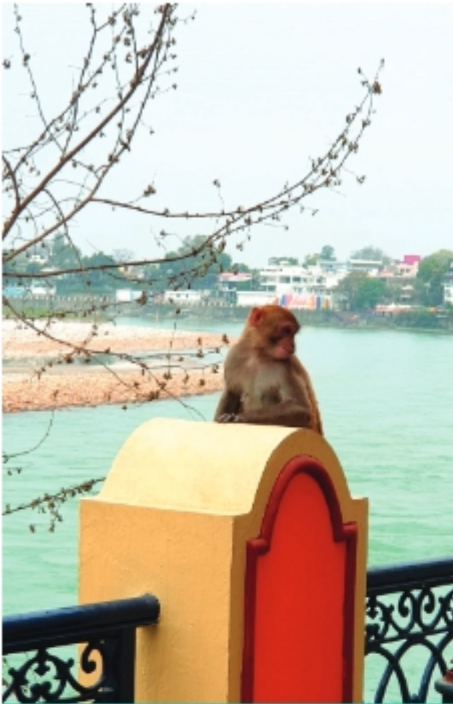
Anchal Sidhana – TAX, DEL