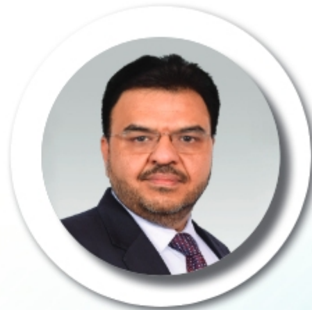
National Head Accounting and Business Support, DEL

Accounting and Business Support services aka ABS, as it is commonly known in our organization, is one of the largest verticals both in terms of revenue and head count. We service clients from across the globe, for all the accounting, taxation, and regulatory needs for their business establishment in India.