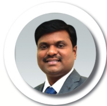
Executive Partner Accounting & Business Support, HYD

Apart from homegrown pharma and IT industry giants, Hyderabad has already become a favorite destination for foreign companies to set up their offshore entities/Global Capability Centers (GCCs). With our exceptional client service and our recent strategic alliance with a global network, nothing stops us from grabbing the opportunity to achieve three times the business and three times the team size in the next three years . We are all geared up and aim to be a significant part of ASA 2.0.