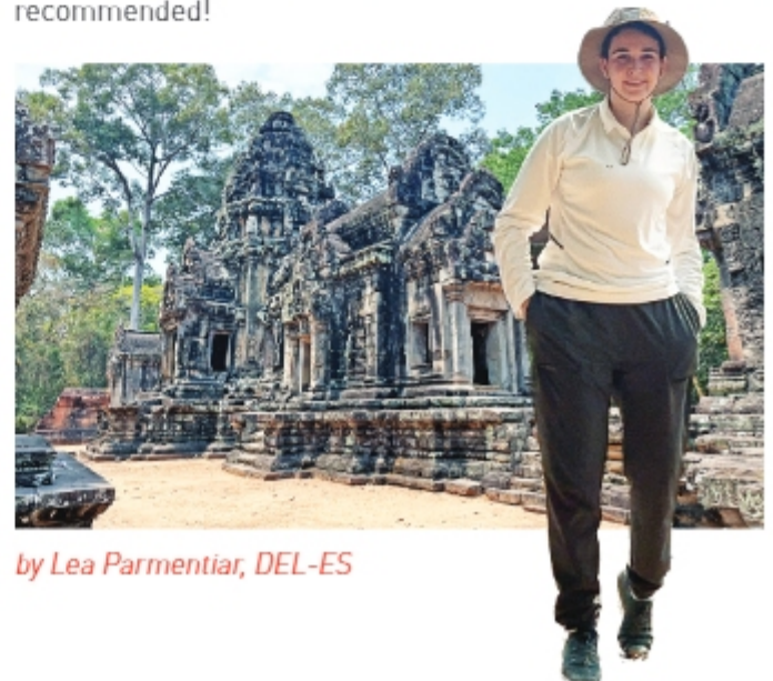
by Lea Parmentier, DEL-ES

In conclusion? Cambodia, 200% wholehearted recommended!