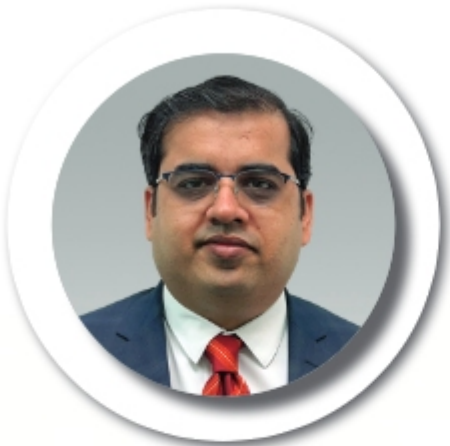
National Head Risk Advisory, MUM

Risk Advisory landscape is rapidly evolving due to changing business, regulatory, and technological landscape. We have seen a decade of rapid changes which include new technologies, digitization, Robotics and Artificial Intelligence which have a major impact on businesses. These create business opportunities and new service avenues for risk advisory professionals. Services such as Cyber Security and ESG are growing very rapidly today. We will see emergence of services such as Data Privacy and tech-based solutions growing in future. Dependence on tech-based platforms for delivering services will grow as clients expect more value addition with less resources and faster turnaround time.