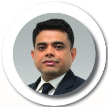
Director Business Advisory Services, GGN

The new era poses new challenges, cross-border investments, borrowings, trade, and economy are on high gear, aided by strong policy intervention and global conditions. The regulatory framework is becoming complex and detailed, demanding first-hand expertise and deeper engagements with clients and industry. The robust economic boom needs to be matched by relentless delivery of quality real time basis. The advisory practice is evolving, new niche practice areas and non-commoditized solutions are needed to match the speed of expansion of the economic horizon of Indian economy. The entry strategy, cross-border greenfield and brownfield investments are on the rise. Thirst for scale and to be the next unicorn, growing demand and relocation of supply chain to India, infrastructure and public spending, sunrise sectors, global realignment, and manpower prowess of India would help the professionals to become techno savvy, futuristic and world class.