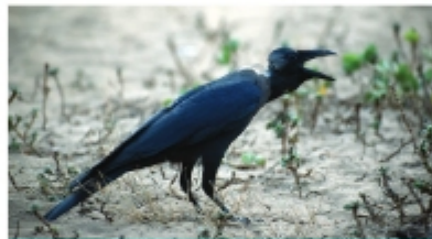
Tulasi Kiran Kambhampati – ABS, HYD