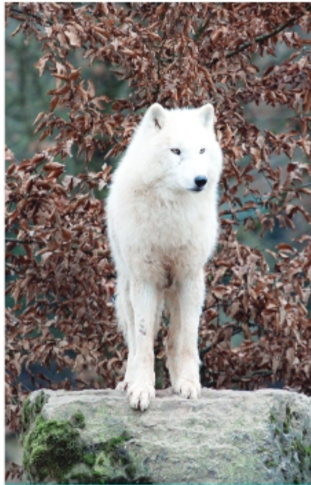
Léa Parmentier – ES, DEL